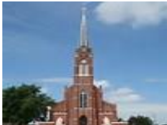
St Liborius Catholic Church